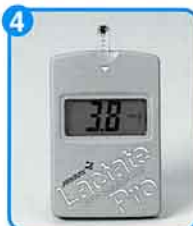
4 Display of blood lactate level.