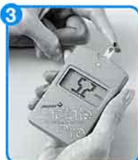
3 Start of measurement.