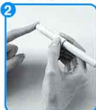
2 Collection of blood.