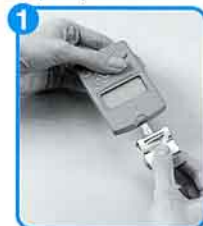
1 Insertion of the test strip.